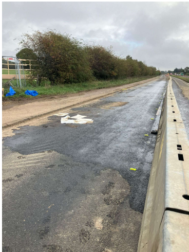
Aftermath of the diesel spill