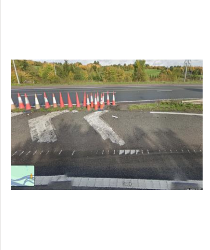
Cones segregating carriageways